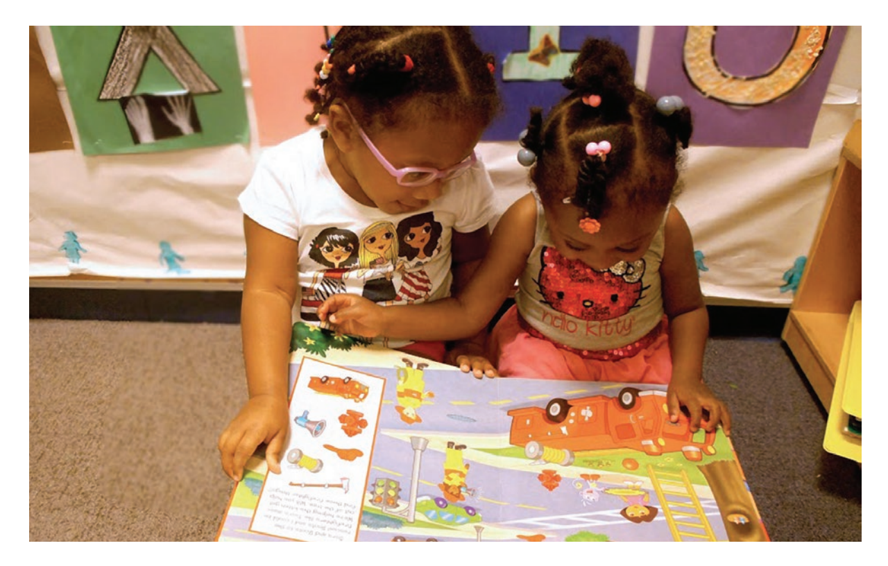
Inclusive settings allow children with and without disabilities to learn alongside one another.